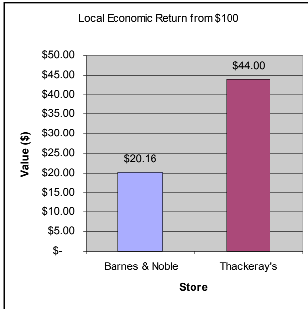
Table 2. Local Economic Impact